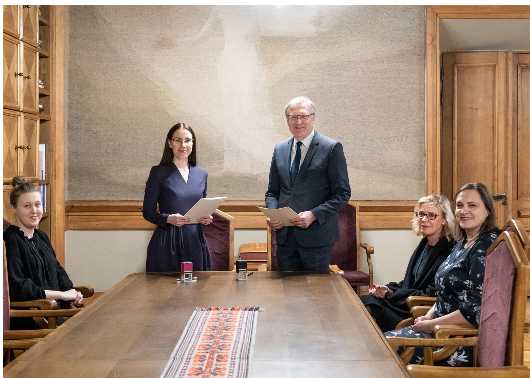
Picture after signing the cooperation agreement between the Office and the Lithuanian University Rectors' Conference