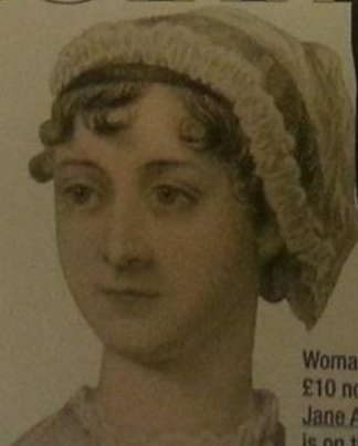
Woman of £10 note: Jane Austen is on the