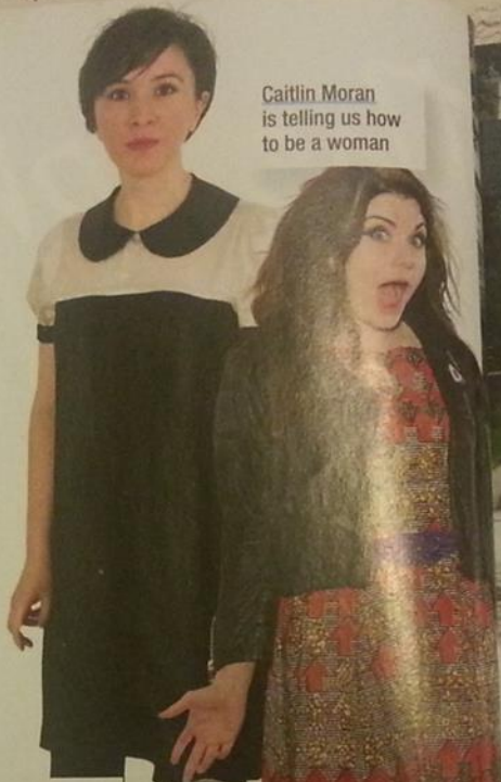
Caitlin Moran is telling us how to be a woman