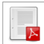
Membership Handbook 2012

The member's handbook 2012 gives an overview of the running of Equinet - from the organisation's structure to a step-by-step guide to internal procedures. Should there be anything that is not clear from the handbook, please feel free to contact the Equinet Secretariat.